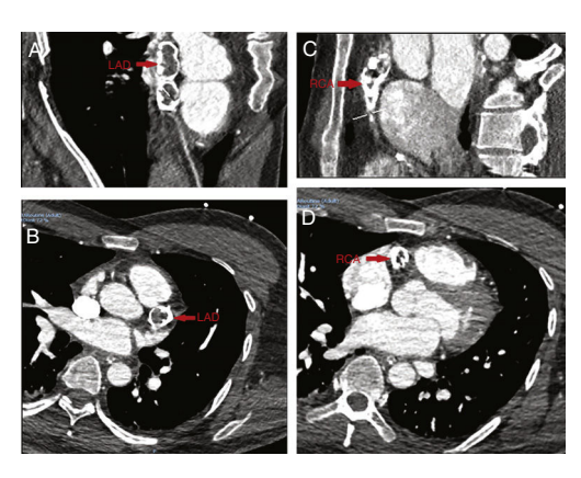
Figure 2 Transverse (B, D) and parasagittal (A, C) CTA images. Ectatic left anterior descending coronary artery (LAD; red arrows in A and B) and right coronary artery (RCA; red arrows in C and D) with intraluminal calcification.

A 29-year-old man was admitted to our emergency department after a cardiac arrest. The patient had suffered sudden cardiac arrest while exercising 30 min prior to his medical evaluation. Bystanders on the scene performed cardiopulmonary resuscitation and achieved restoration of spontaneous circulation after about 10 min. In the emergency department, the patient developed repeated convulsions. Consequently, the patient received intra-tracheal intubation was admitted to the ICU. A chest computed tomography (CT) showed patchy high-density abnormalities in the heart shadow area (Fig. 1). Electrocardiography and echocardiography results with no obvious abnormalities. The patient's parents reported that he did not have a history of heart surgery. Suspecting cardiogenic etiological factors, we performed a coronary CT angiography (CTA).