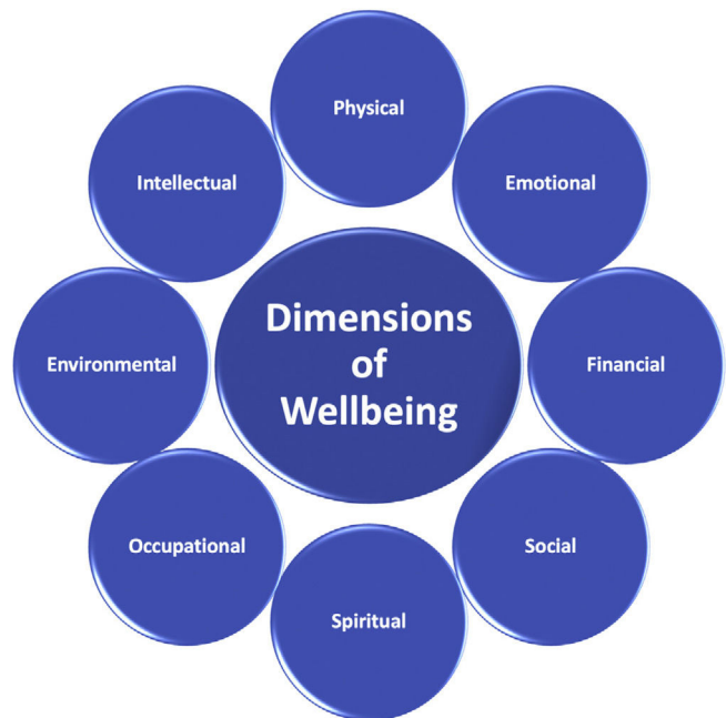
Figure 1 Dimensions of wellbeing.

Wellbeing is a complex concept, which varies according to the context and the individual. 5 It relates to a wide range of dimensions (Fig. 1). More than twenty years ago, Ryff et al. 5–7 started to study wellbeing. They developed a six-factor model of psychological wellbeing which determines six factors that contribute to an individual's psychological wellbeing, contentment, and happiness. This model of psychological wellbeing differs from past models in