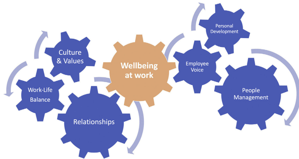
Figure 2 Wellbeing at work. Beyond personal development and work-life balance, many gears must intertwine to create a wellbeing culture in the professional environment.