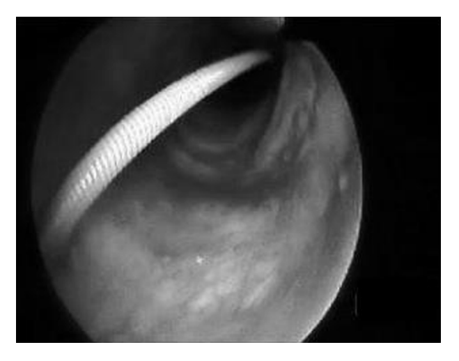
Figure 2 Endoscopic view during percutaneous tracheotomy, at the point of metal guide insertion.

Pneumonia is the most common nosocomial infection in the ICU,<sup>8-10</sup> causing important mortality,<sup>11,12</sup> prolonging mechanical ventilation and generating important costs due to the lengthening of hospital stay.<sup>13,14</sup> In our ICU we apply the ''invasive'' strategy, 15-18 based on the use of fibrobronchoscopy for microbiological diagnosis and quantitative culturing of samples selectively obtained from the purportedly affected zone. This is the strategy recommended by the main scientific societies<sup>12,19</sup> for diagnosing ventilation associated pneumonia (VAP). In our series, almost one-half of the patients subjected to BAL yielded a positive microbiological result-the technique being indicated when clinically suspecting the existence of ventilation associated pneumonia or in immune depressed patients, where BAL has been shown to offer increased performance.<sup>20</sup> The resolution of atelectasis was the most frequent therapeutic indication. The efficacy of bronchoscopy in this context is subject to controversy. Kreider et al.,<sup>21</sup> in a systematic literature review, observed important variations in the efficacy of fibrobronchoscopy, between 19 and 89%<sup>22,23</sup>-the best results being obtained in application to lobar atelectasis produced by a central mucus plug, while the poorest performance corresponded to subsegmental atelectasis. Marini et al.<sup>24</sup> compared fibrobronchoscopy versus intense