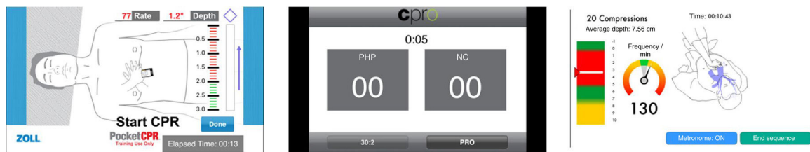
Figure 1 Apps used: Pocket CPR®, CPR Pro®, and Massage cardiaque et DSA®.