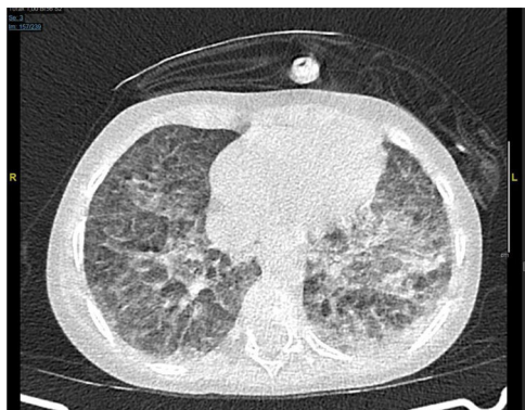
Figure 1 Thoracic CT scan with bilateral ground-glass opacities.

Four days later he was admitted to the Day Hospital with signs of fever of 100.4°F and pancytopenia (420 leukocytes/ \mu L and 40 neutrophils/ \mu L). At home he remained asthenic but still without a fever. He was admitted to the pediatric oncology unit and administered cefepime (150 mg/kg/day) followed by prophylactic cotrimoxazole.