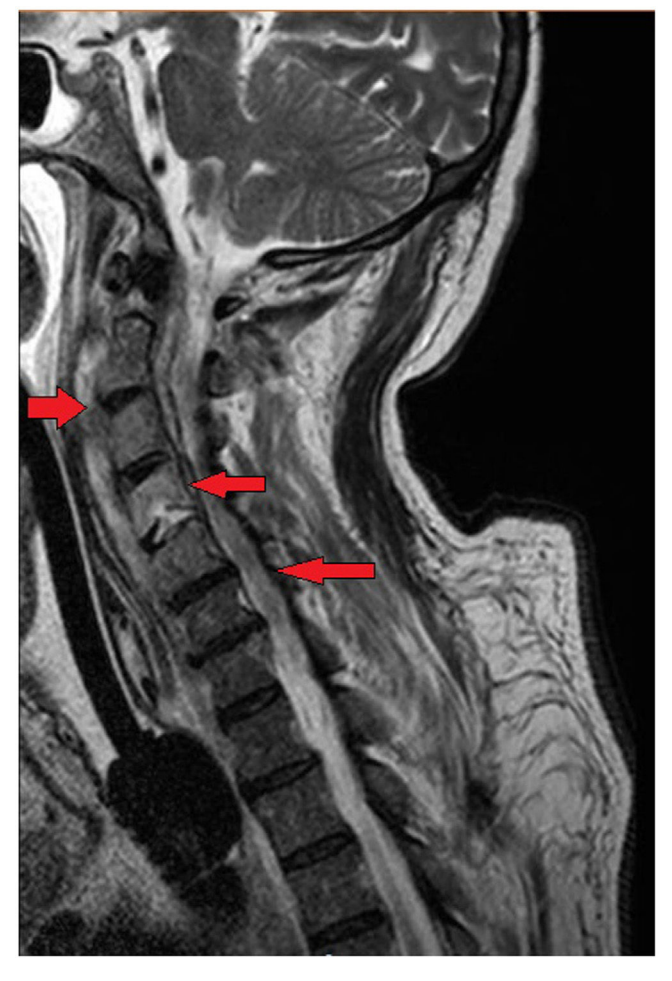
Figure 3 Reduction of paravertebral collection and epidural inflammatory component without evidence of the collection (arrows). Also, the arrows are pointing to the persistence of damage to the C4 vertebral body.