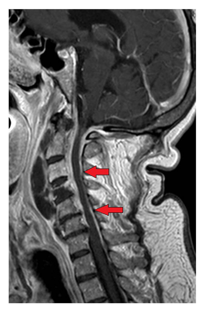
Figure 2 Epidural damage surrounding the medullary cord from C2 to C6 on the T1-weighed sequence (arrows).